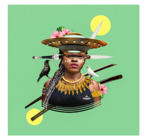
Illustration: "Lost in the Island"