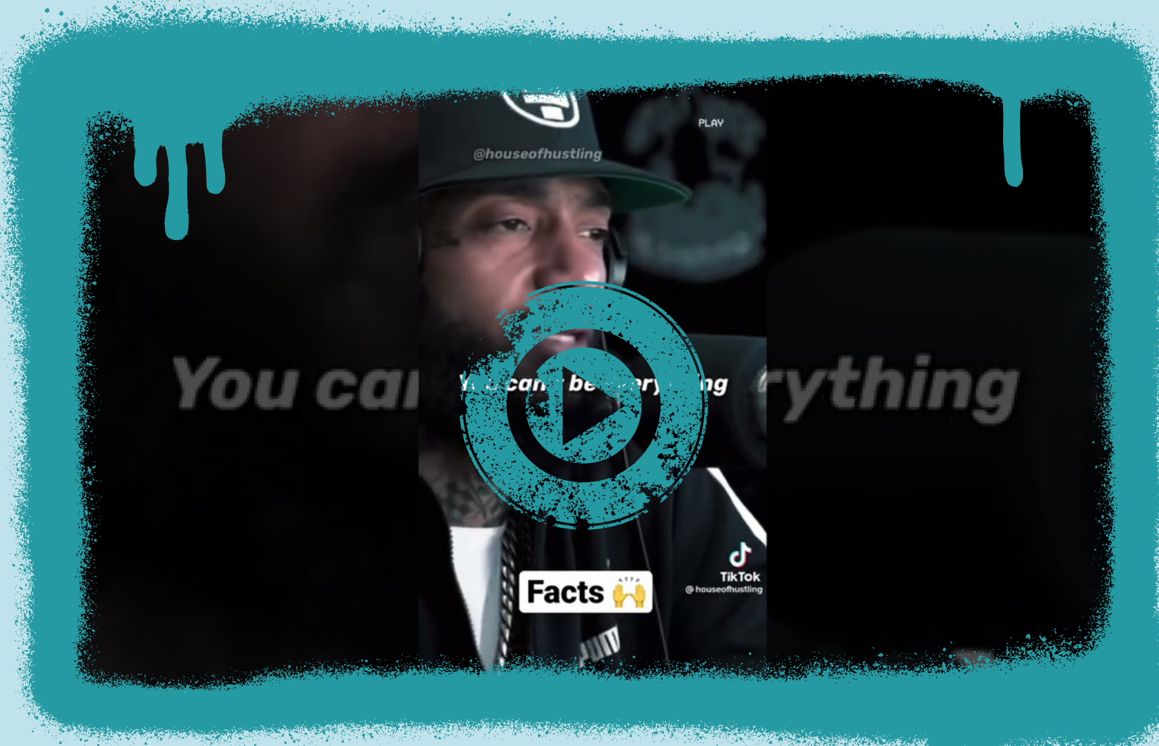
"Nipsey Hussle - Be Yourself"