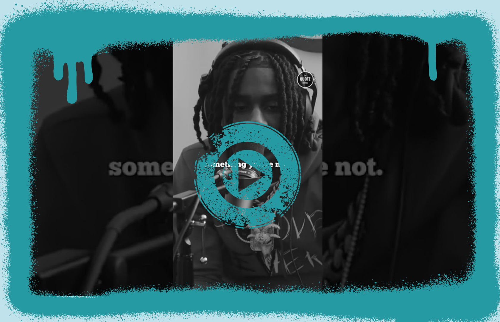
"Polo G - Be Yourself"